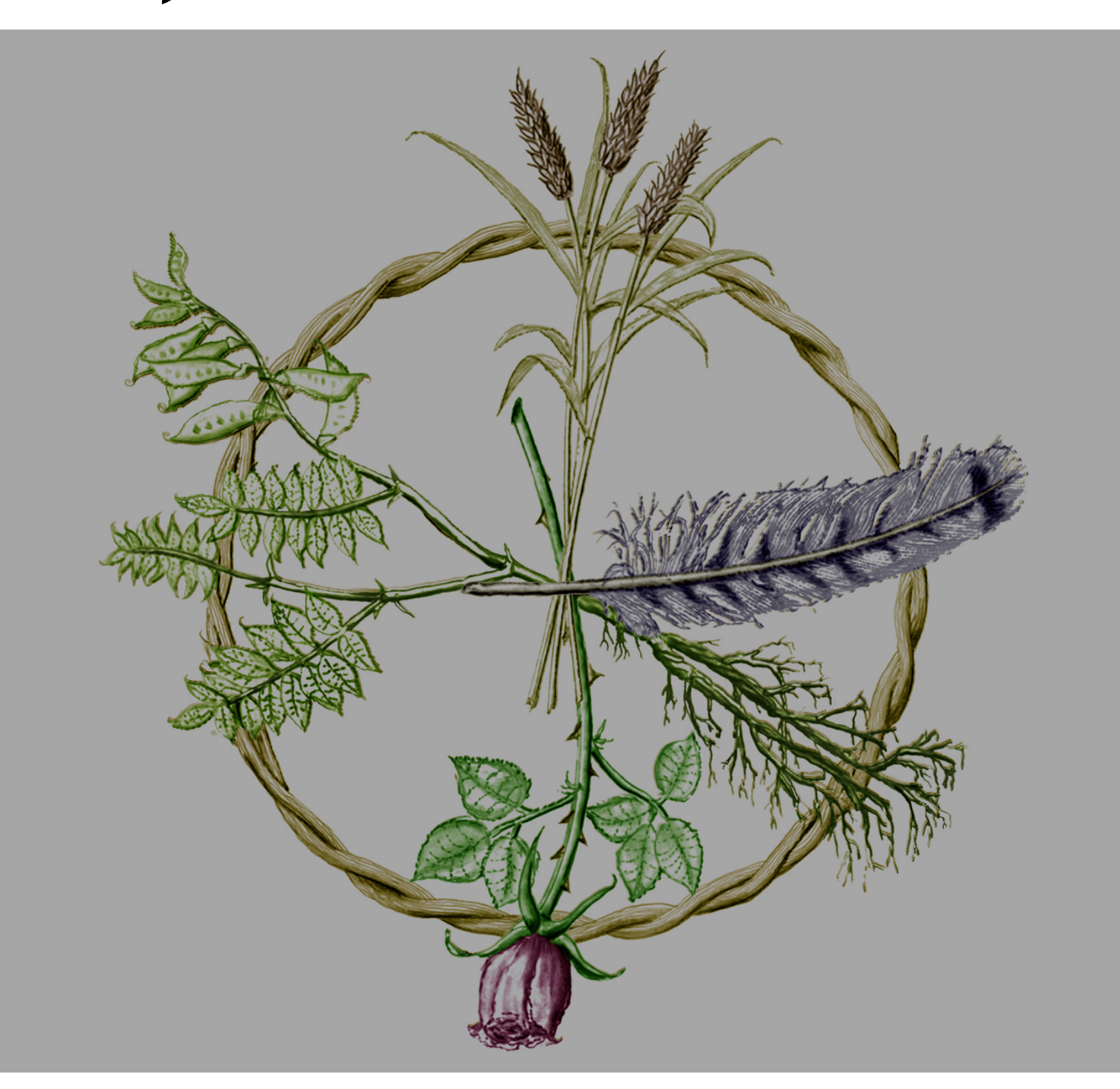
By: Esther Cohen